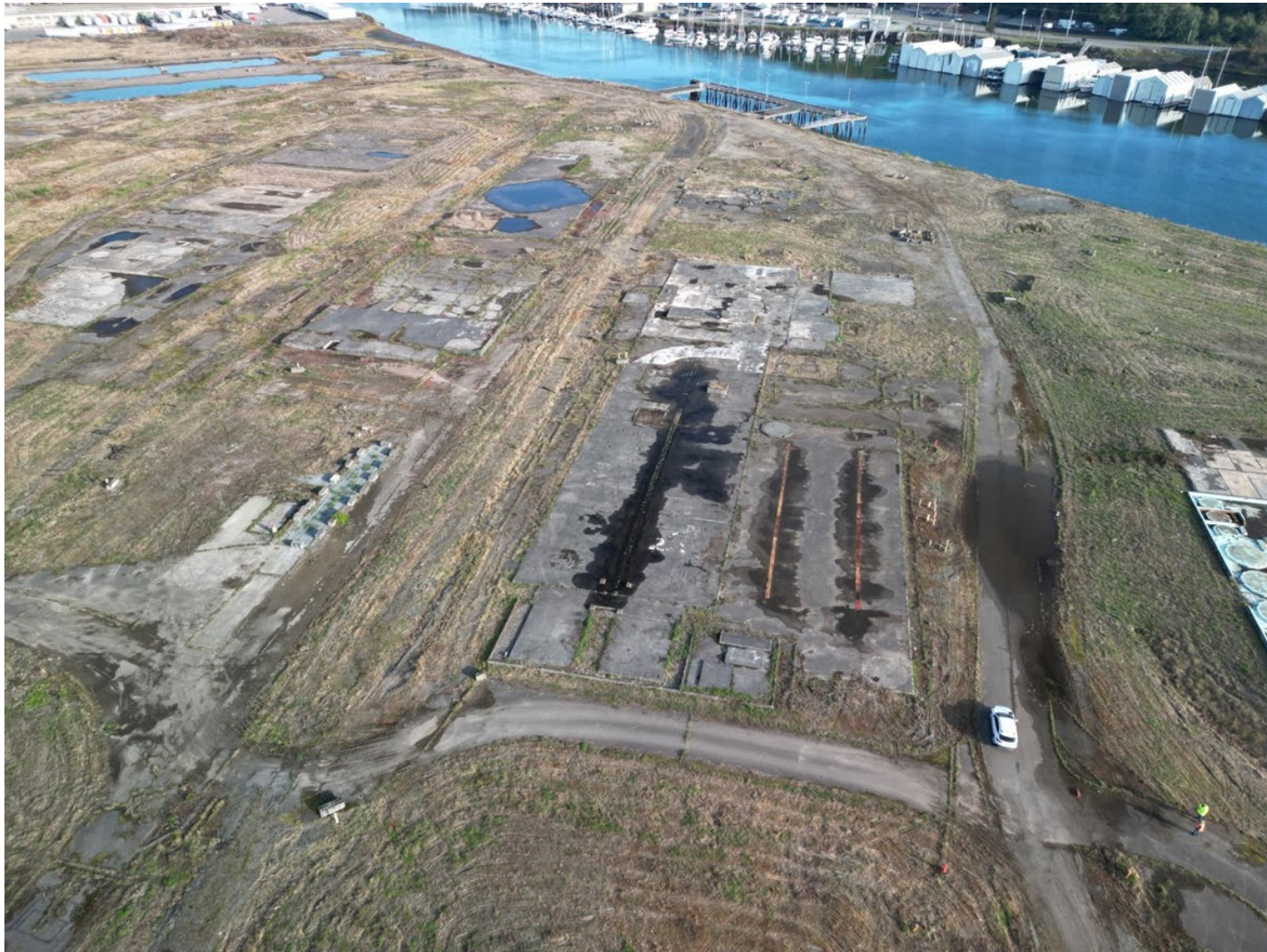
Remains of Manufacturing Area