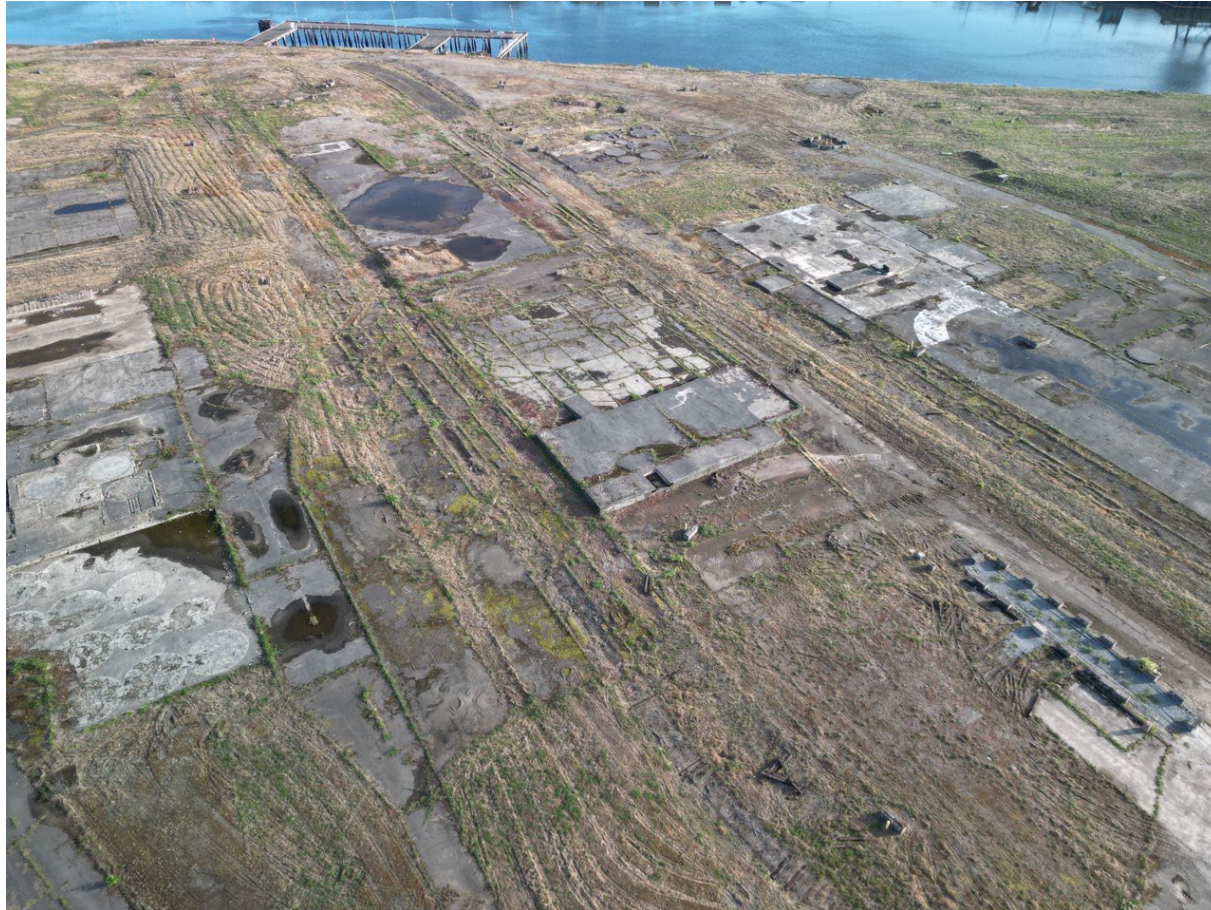
Looking Towards Hylebos